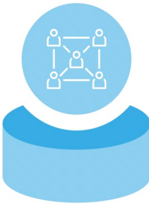
Data Security & Privacy