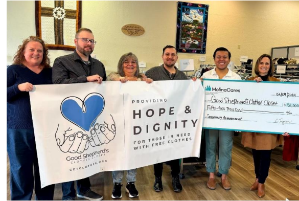
2/9/24 Good Shepherd's Clothes Closet, Reno, to purchase a truck and trailer to transport clothing donations to microsites across Washoe County