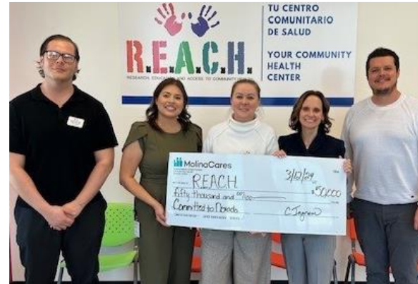
3/15/24 REACH, Las Vegas, to hire a Community Health Worker (CHW) focused on engaging the Hispanic Community