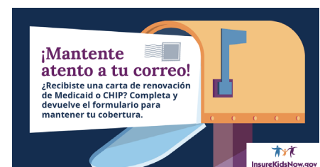
"Mailbox" in Spanish

Los Estados se comunican con las familias inscritas en Medicaid y CHIP por correo postal. Asegúrese de que su información de contacto esté actualizada para que no se pierda de las últimas noticias e información de renovación importante. Averigüe más: AccessNevada.dwss.nv.gov .