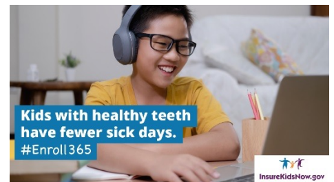
“Healthy Teeth” in English

Kids learn better when their teeth are healthy. When oral health problems are treated and children are no longer experiencing pain, their ability to learn and school attendance improves. Medicaid or CHIP cover eligible children up to age 21, and benefits include dental care. Learn more: AccessNevada.dwss.nv.gov .