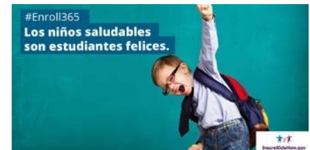
“Happy Students” in Spanish

Recuerde que Medicaid y CHIP brindan acceso a la atención de rutina gratuita – incluidas las vacunas contra la influenza- para que los niños puedan mantenerse saludables durante todo el año escolar y más allá. Las familias elegibles pueden inscribirse en cualquier momento del año. Obtenga más información sobre la cobertura en Nevada AccessNevada.dwss.nv.gov .