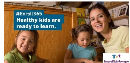
“Ready to Learn” in English

Kids who have health coverage are better prepared to learn and are less likely to miss school. Medicaid and CHIP cover preventive care, prescriptions, and vaccines. Learn how you can apply and get your kids ready for school! AccessNevada.dwss.nv.gov .