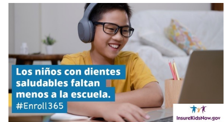
"Healthy Teeth" in Spanish

Los niños aprenden mejor cuando sus dientes están saludables. Con tratamiento y cuando los niños ya no sienten dolor, su habilidad de aprendizaje y asistencia escolar mejora. Medicaid o CHIP cubren a los niños elegibles hasta los 21 años y los servicios dentales están cubiertos. Más información: AccessNevada.dwss.nv.gov .