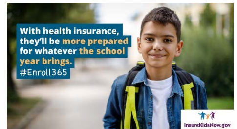
“New School Year-Backpack” in English

Kids with health insurance are more likely to complete high school (and graduate college) than their peers who don't have health insurance. With Medicaid and CHIP coverage, children have access to important routine care services including doctor visits, dental care, and vaccines. Learn more about the services offered through Medicaid Nevada: AccessNevada.dwss.nv.gov .