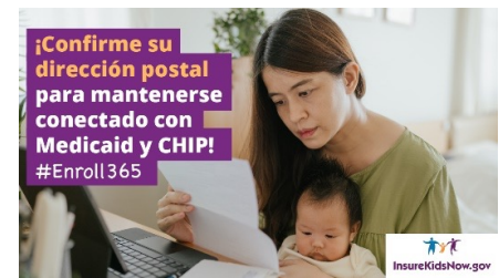
"Mailing Address" in Spanish