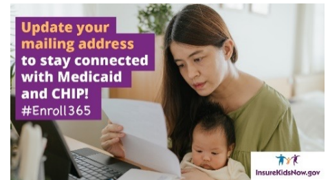
“Mailing Address” in English