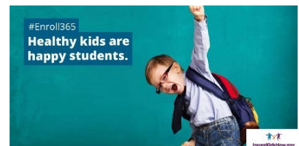
“Happy Students” in English

Remember that Medicaid and CHIP provide access to free, routine care, including routine vaccines so kids can stay healthy throughout the school year and beyond. Eligible families can enroll any time of the year. Learn more about coverage in Nevada: AccessNevada.dwss.nv.gov .