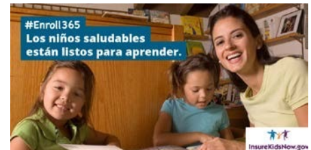
“Ready to Learn” in Spanish