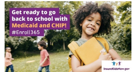
“Back To School” in English