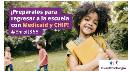
“Back to School” in Spanish